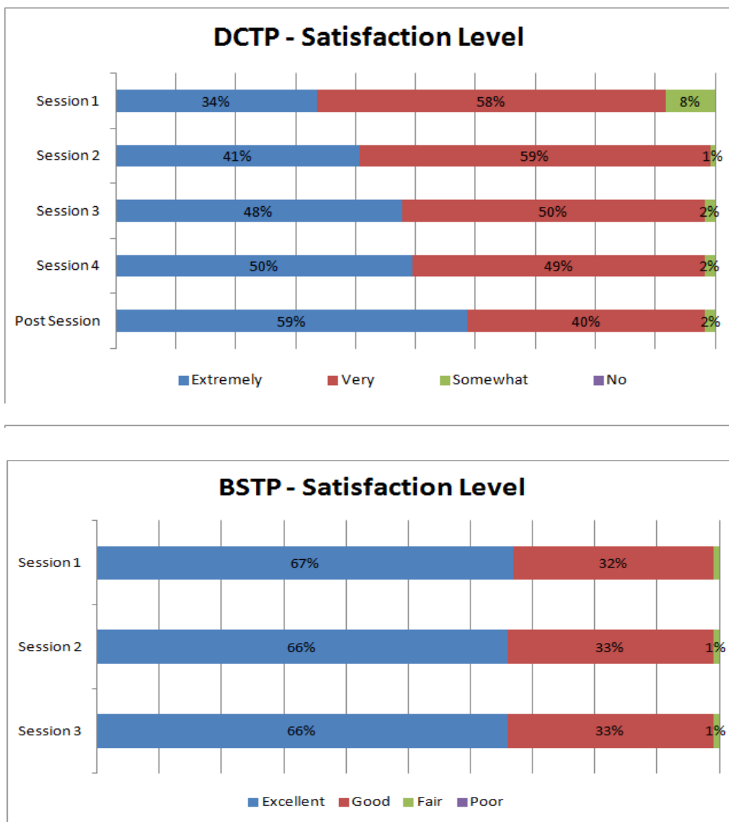
Figure 3.3 Overall Program Satisfaction Rates for DCTP and BSTP

The overall program satisfaction rates for both DCTP and BSTP may be seen in Figure 3.3. Throughout their respective sessions, both DCTP and BSTP participants expressed a 99% average satisfaction rate for the organization and content of the session, clarity with which the information was provided, group discussions, audio/visual learning aides, and the presenter’s knowledge of the subject matter. However, BSTP and DCTP participants were in disagreement regarding the amount of information provided in the training sessions. For DCTP, on average 9.5% of participants felt that they received too much information, while 100% of BSTP participants felt they had received just the right amount of information in all sessions. This may be due to differences in demographics of DCTP participants – many are immigrants and may experience language barriers.